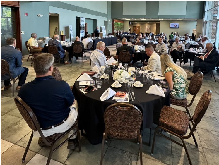
Audience Listen to Speakers attentively