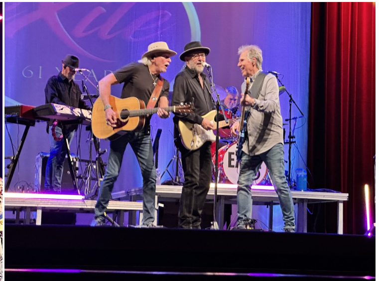
Exile Sings "Kiss You All Over"