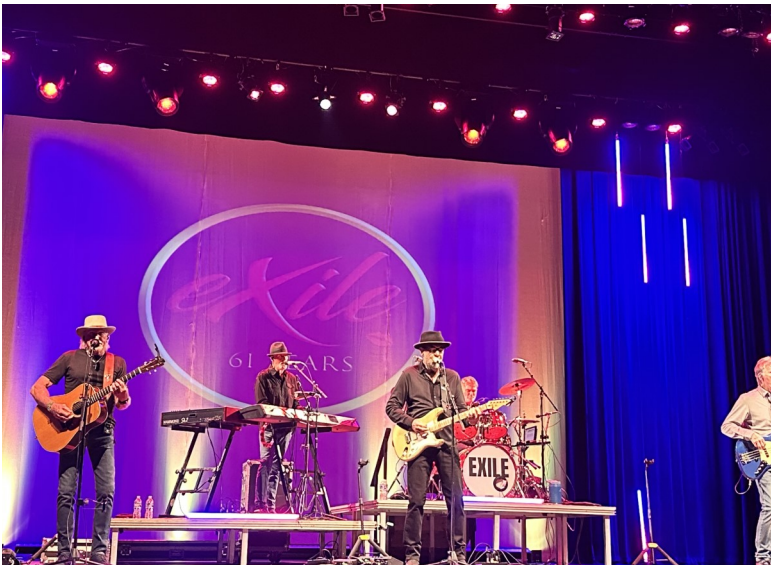
Exile Performs in Theatre for Symposium